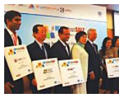
First cyber sale